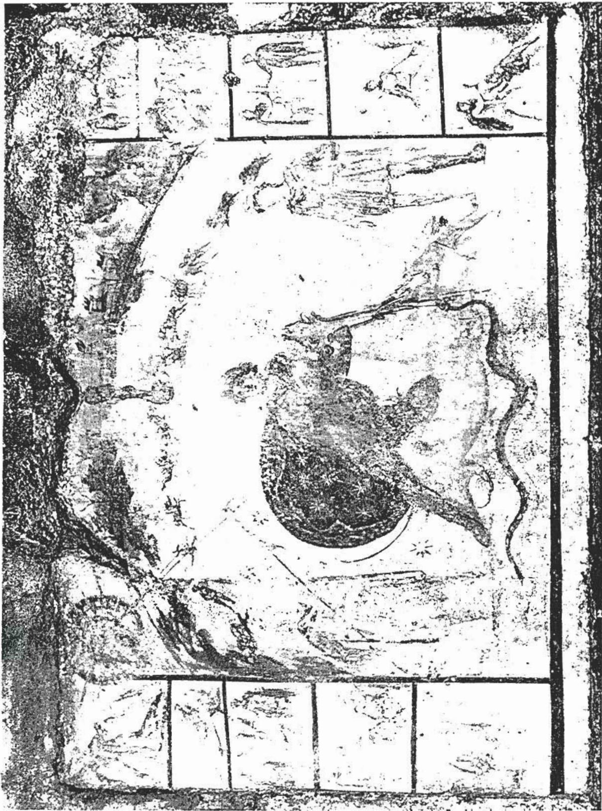
Barberini Fresco (CIMRM 390) 220-250 CE